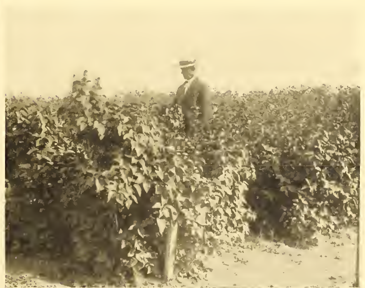
Some of our Lilacs